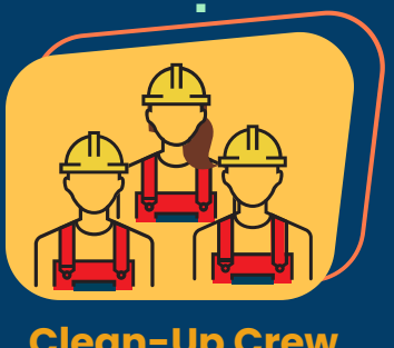
Clean-Up Crew <u>Classification 5610</u>

The executive level supervisor is assignable to Classification 5606, <u>Contractors – construction or</u> <u>erection – executive level</u> supervisors, and the clean-up crew is assignable to Classification 5610 , Contractors - construction or <u>erection – all construction</u> subcontracted - all other employees. Classification 5610 applies to employees who perform a variety of incidental activities around the job site such as job site clean-up, debris removal, or completing punch list or warranty repair tasks.